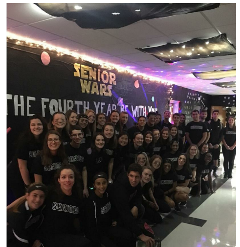
Seniors gathered to show off their winning hallway on the last day of Spirit Week. The seniors beat out the freshmen for the honor.